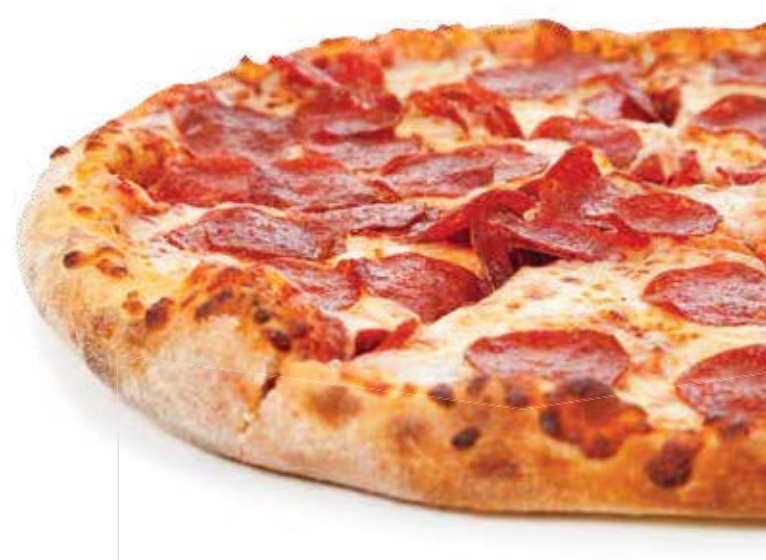
Warm, fresh pizzas and other on-the-go favorites, courtesy of Nemco's merchandiser line that combines high design style with features like on-board humidity.

Nemco's Open-View Merchandisers Less-is-more designs that artfully showcase the food above all else.