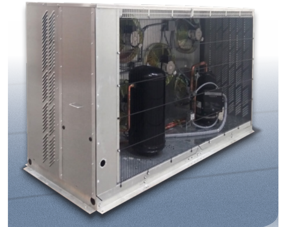
Shown: The NEW High Efficiency H-Series Condensing Unit designed for DOE 2020 applications