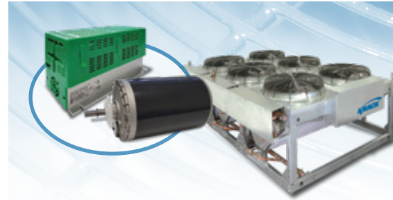
Shown: The NEW Vspeed Variable Speed Motors for Microchannel MXK (also available with Levitor II LAVK)