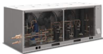
Shown: The NEW Proto-Aire EZ Refrigeration System