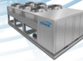
Shown: C-Series Condensing Unit

Options for other refrigeration systems to configure with evaporators and condensers include Parallel racks and Protocol to match any refrigeration need for a centralized or distributed system.