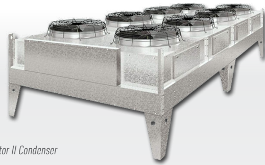
Shown: Levitor II Condenser

For nearly 90 years, Krack, a Hussmann Corporation brand, has been committed to delivering products with design leadership and innovation that provide customer-focused solutions for all your commercial refrigeration needs.