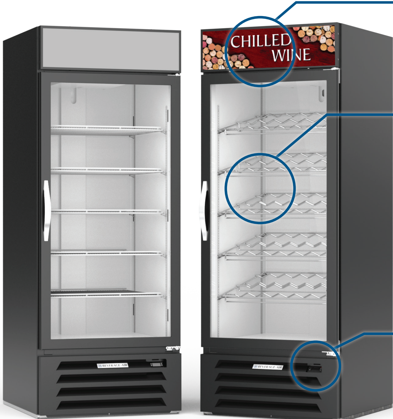
standard MarketMax wine unit

The MarketMax wine units have the same great MarketMax features, with wine-specific options to create the ultimate wine merchandiser.